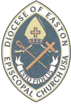
DIOCESE OF EASTON